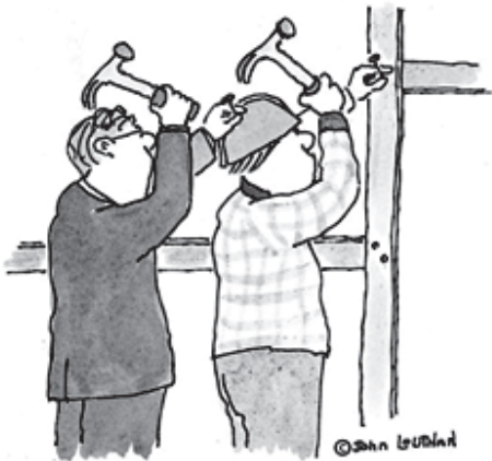
"Management and labor working in tandem."

They may tell you that you will not be able to speak with your supervisors or managers and that you will have no control over what is decided in your workplace.